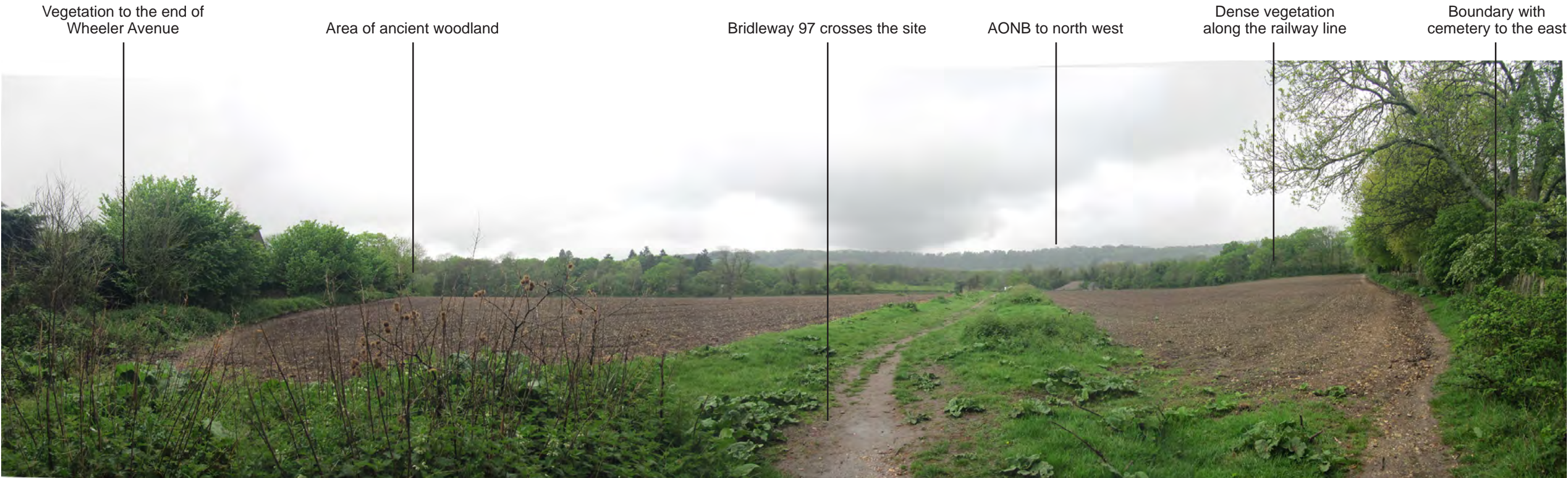
Photograph 75: View north west across the site