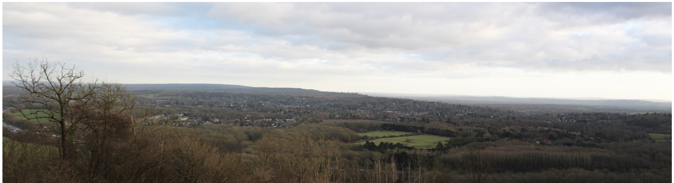
Panorama of view from Ganger's Hill (January 2026)