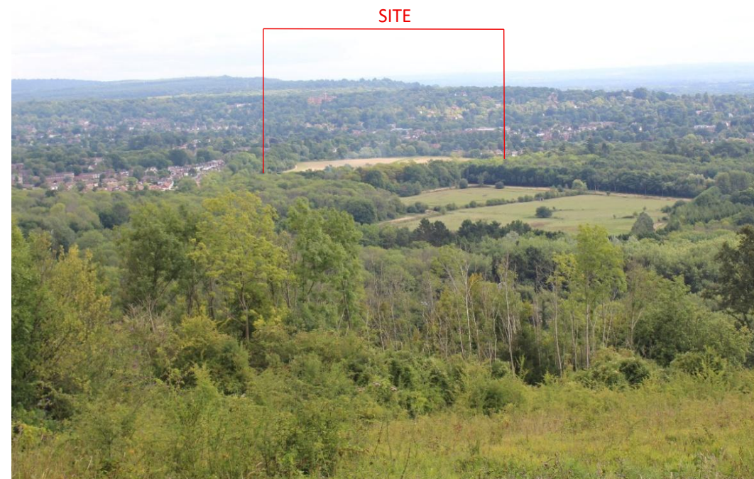
Figure 13: View from Ganger's Hill (Landscape Proof of Evidence of Mr Dudley)