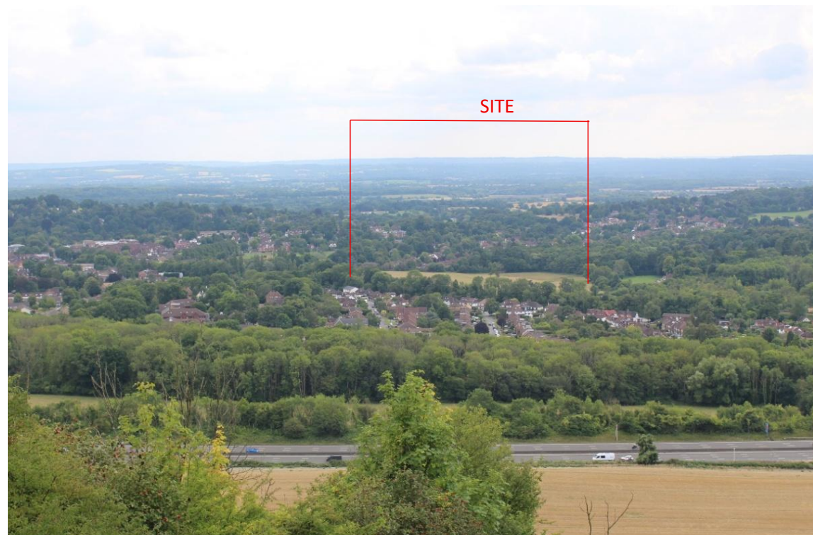
Figure 12: View from Whistler's Steep (Landscape Proof of Evidence of Mr Dudley)