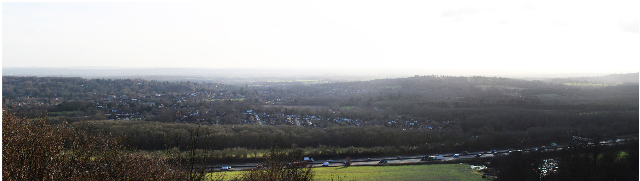
Panorama of view from Whistler's Steep (January 2026)