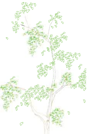
Detail of tree root protection zones - Section DD