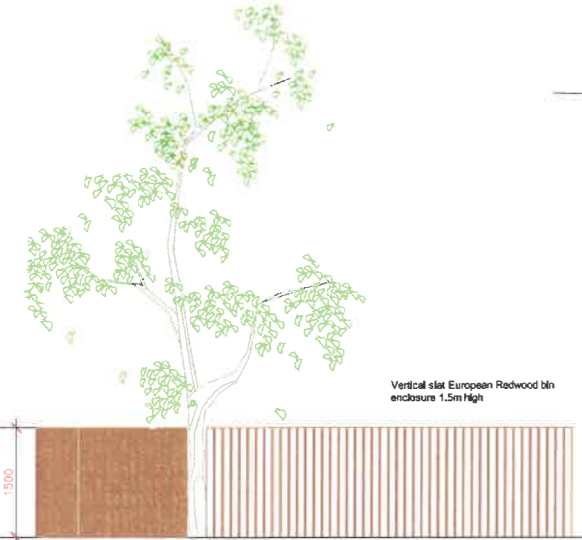
Bin enclosure elevation from entrance drive